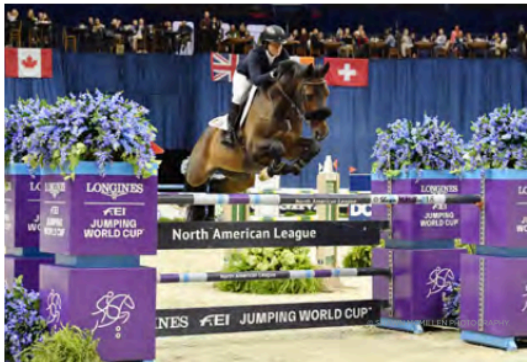
Beezie Madden and Breittling LS winning the President's Cup Grand Prix.

Beezie's earliest memories of WIHS are of showing in the amateur jumpers during college while training with Katie Monahan-Prudent when the show took place in Landover, Md. "Competing at Harrisburg, Washington, and the Garden at the time was something that I really looked up to and hoped I could do some day," she recalled. Her start in the open jumper division at WIHS came in 1986 when she rode for Still Meadow Farm on their mount Medrano. That same year, she also had the chance to ride Prudent's Black Gold in the puissance, where she recalls jumping seven feet, one inch. "That was the first time I'd ever done a puissance, and I can still remember it!" she said.