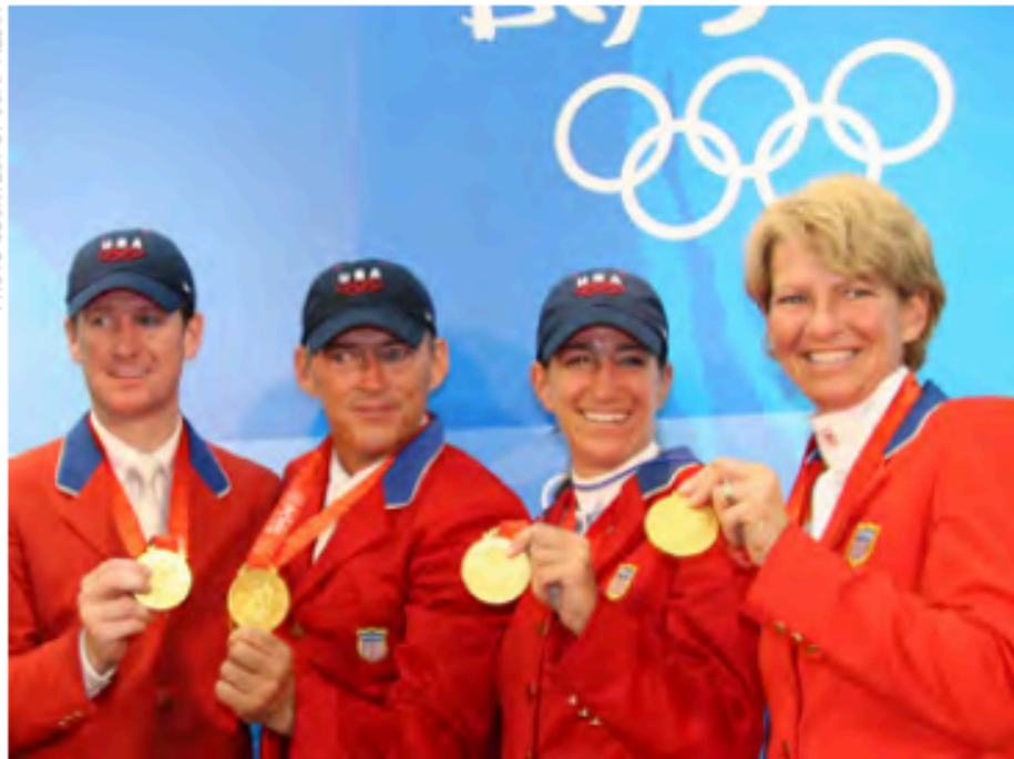
McLain Ward, Will Simpson, Laura Kraut, and Beezie Madden showing their team gold medals after winning at the 2008 Beijing Olympic Games.

very first grand prix win together. While usually a "super second horse" for her, he could step up when called on. "It was pretty special when he did, because he was basically overachieving for his ability," she remarked. "He was such a quality horse with a lot of try in him, and he was fast. If you got to the jump-off, you had a good chance!"